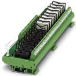
VARIOFACE module, for 16 plug-in miniature relays or miniature optocouplers, with LED, 110 V DC input voltage

Please be informed that the data shown in this PDF Document is generated from our Online Catalog. Please find the complete data in the user's documentation. Our General Terms of Use for Downloads are valid ( http://phoenixcontact.com/download )